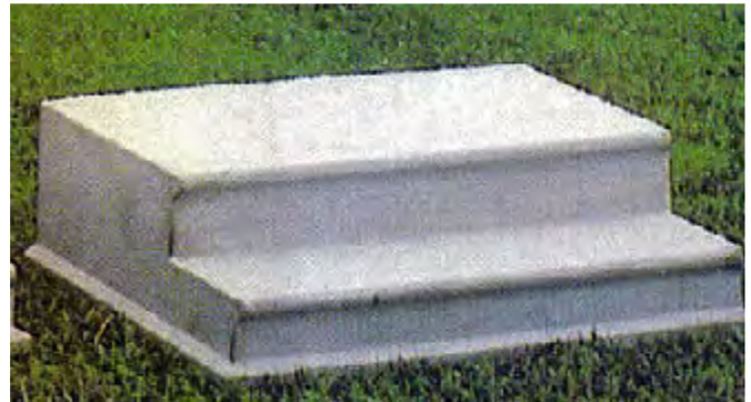
2 STEP - WITH STOOP