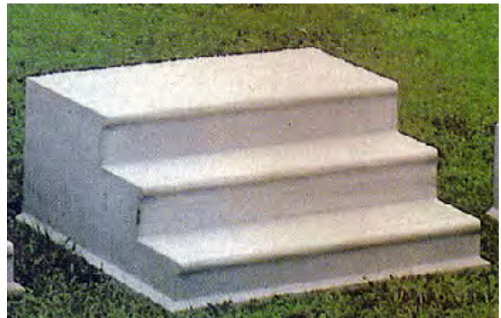
3 STEP - WITH STOOP